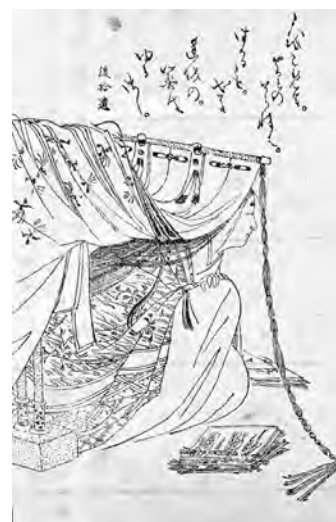
Drawing of Sei Shōnagon by Kikuchi Yosai (1781–1878).