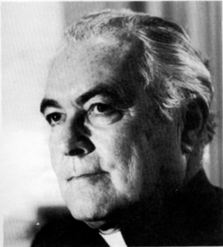
The Reverend Theodore M. Hesburgh