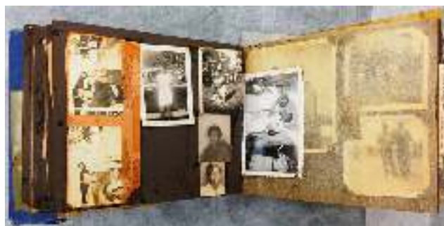
Fig. 5. Support and interleaving pages of the Glaze and Rider Families scrapbook with handwritten annotations on adhered photographs.

Some of our scrapbooks began as blank journals, ledgers, or traditional photo albums; however, many started as repurposed textbooks, magazines, sketchbooks, and one was even stacks of file folders! A few were custom-made like artists' books. Some scrapbooks posed unique structural issues. This was the case with a shared album between two Georgia families, the Glaze and Rider families. In the 1960's, the Glaze family used the heavy support pages for their photos. The thin interleaving pages were used by the Rider family in the 1970's, for mostly saved newspaper articles. This structure was unique because of its original Bakelite plastic covers. Ultimately, the pages were removed from the fragile binding, encapsulated, and post-bound. We retained the original Bakelite covers and housed everything together in a custom-fitted box (fig. 5).