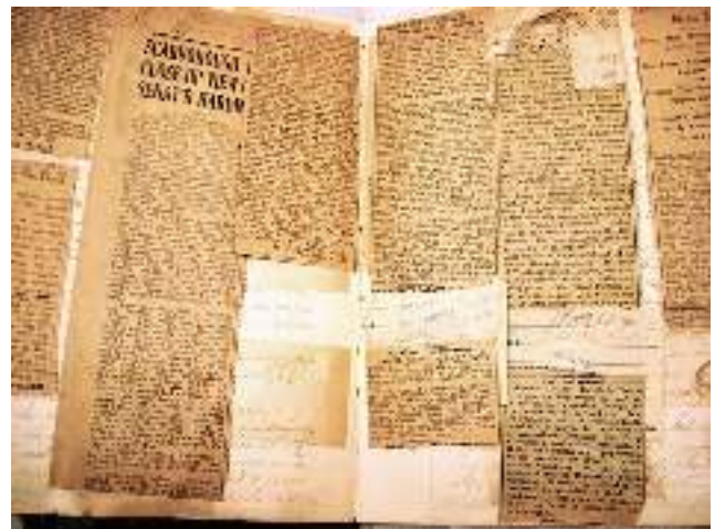
Fig. 3. Pages of deteriorating, acidic newspaper clippings in William S. Scarborough’s scrapbook, originally a blank journal book structure.

During this grant project, we developed decision-making processes for treating different scrapbook formats. Historic importance, current condition, and frequency of use determined our conservation decisions. Whether turn-of-the-century constructions or 1970’s magnetic albums , the