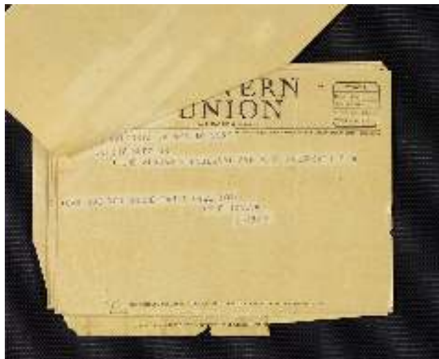
Fig. 9. Example of a partially obscured item.

separation of the layers and again after the telegrams were encapsulated (fig. 9).