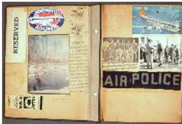
Fig. 4. Pages of artist Benny Andrew's scrapbook with handwritten annotations of photographs, felt patches, and ephemera.

Bound without regard to the thickness or weight of the contents, most of the book structures were strained beyond capacity, often wedge-shaped or completely broken. Disbinding proved to be necessary more often than not in order to protect the contents. As an added benefit, we were able to achieve better digital images from the flattened pages.