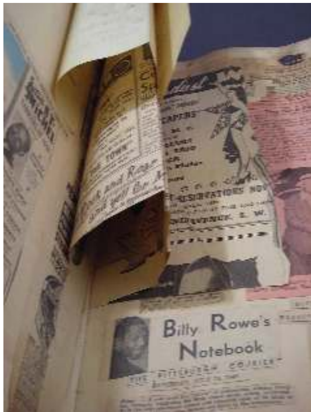
Fig. 1. Johnny Hudgins scrapbook—multiple layers of folded brittle newspaper.

we reassemble them within the scrapbook? We developed a Treatment Survey Form to tally the occurrences of different types of damage, as well as record the numbers of extra images that would have to be shot of each page in order to capture multiple sides of items, such as a letter in an envelope, a pamphlet, the backs of photographs, and each layer of overlapping newspaper articles that had hidden information (fig. 1).