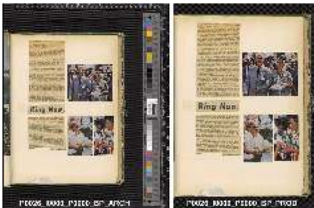
Fig. 8. Examples of Archival (left) and Production processed images.

cropped tightly around the primary page or item and were given the extension _PROD (fig. 8).