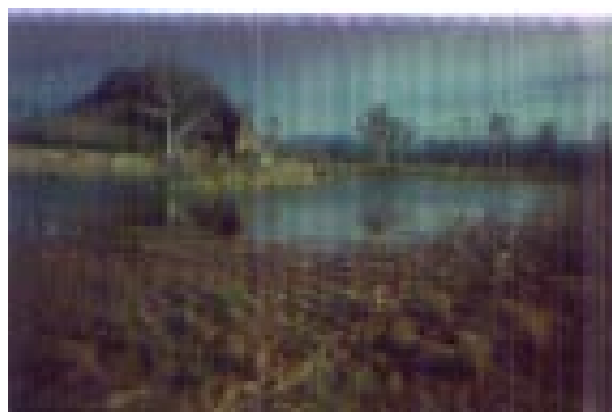
Figure 3. A semi-permanent waterhole located in the bed of the Finke River, near its source, 3 km upstream from Glen Helen Gorge, Northern Territory.

In the low lying regions of central Australia, water-courses scour out coarse bed material during rare floods, and quite large holes may be formed, especially where