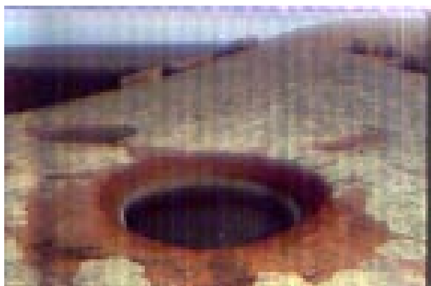
Figure 2. A gnamma of the deep, pit-shaped variety on Pildappa Rock, a granite inselberg near Minnipa on the upper Eyre Peninsula, South Australia. This ovate gnamma measures 2.7 by 2.3 metres and has a depth of 70 centimetres.

to a rock depression capable of holding water. In fact, “gnamer rockhole” and “namma-hole” are both tautologies because the Aboriginal word “gnamma” by itself meant a rock-hole.