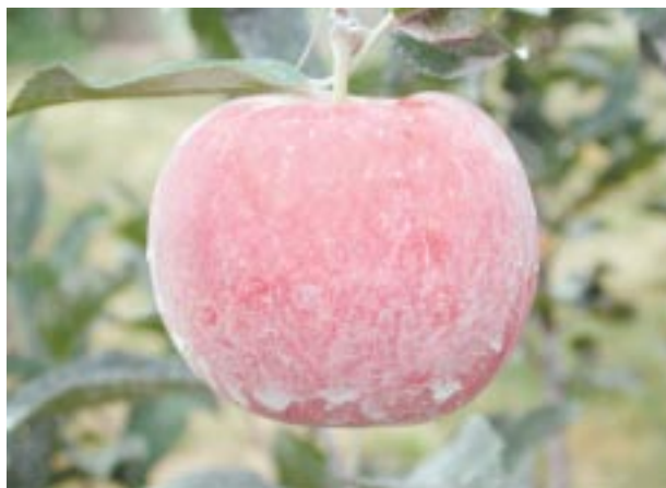
Fig. 11. A visible kaolin clay film must cover apple to be an effective insect deterrent.

One product homeowners may consider using for control of apple maggots is a kaolin clay (Surround At Home®). This clay product is not a true pesticide and is not toxic to apple maggot or other insects. These products form a barrier film that irritates insects and disguises the host. Insect pests avoid the kaolin-treated trees and fly to other potential host trees. Kaolin clay works best when the visible film barrier is established over the entire tree before fly activity begins. Begin applying kaolin clay by late June and reapply every 7 to 14 days, or more frequently if it rains, to maintain a good visible film on the apples (fig. 11). You can monitor apple maggots with sticky cards and begin applying kaolin at first fly catch. Apply Surround At Home® at a rate of 1/2 pound (about 3 cups) per gallon of water and spray onto tree until the product begins to drip from the leaves. Use enough product