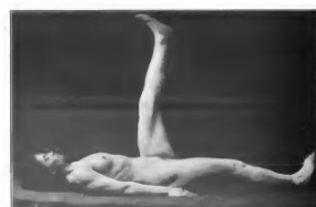
Fig. 72. Beinwechsel in der Rückenlage. Beide Knie sollen durchgedrückt sein. XVI.